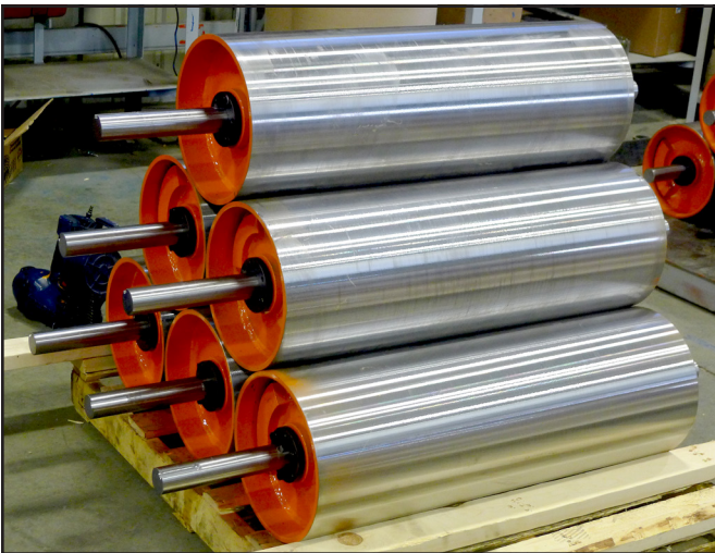
High Speed Balanced Drums

Increase the Conveying Performance of your Saw Mill Operation with Luff Pulleys